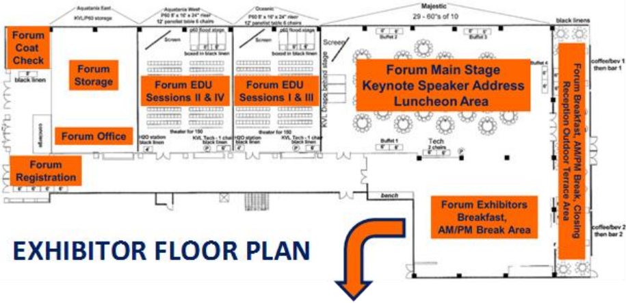
EXHIBITOR FLOOR PLAN